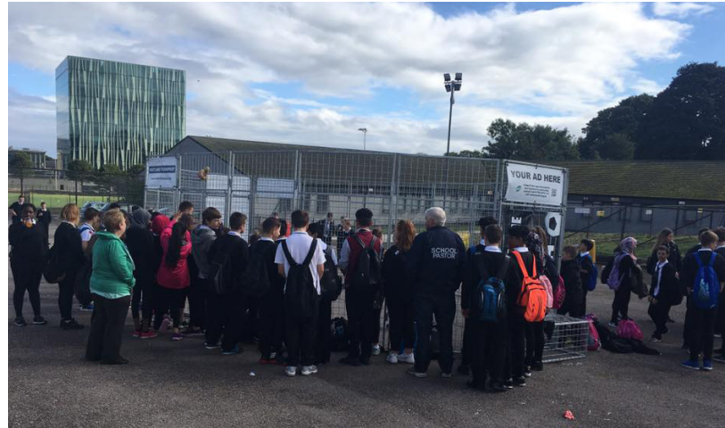
The Cage at St Machar Academy

of developing their self confidence, self esteem and self regulation skills. He is a wonderful role model for all the children and this is particularly important for some of our boys to have a very positive male