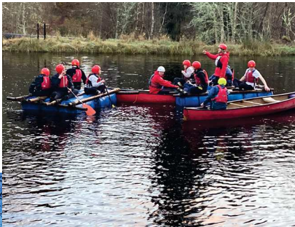
Some scenes from the weekend away

people + leaders headed off after school on the Friday for what was a very enjoyable and encouraging weekend away. Over the course of the weekend there was lots of fun had with activities such as raft building, archery, team games, zip lining and a hike. A huge encouragement was the response from various young people to our sessions in the gospel of Mark. Over the weekend we had four talks from Mark's gospel. Throughout our time together we were able to have very open and honest conversations around faith and what it means to follow Christ.